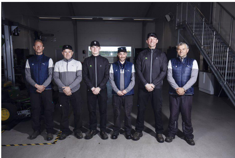
2020 FEGGA Greenkeeping Scholarship Students