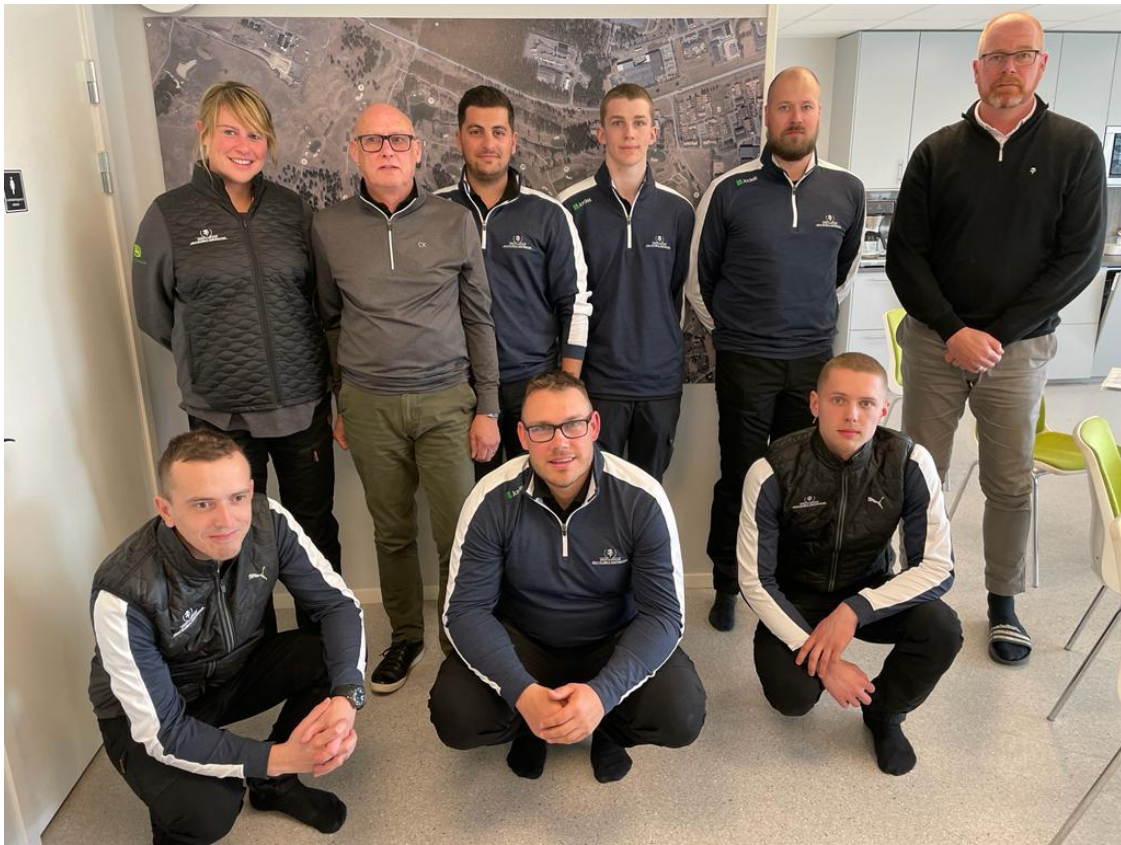
2022 FEGGA Greenkeeping Scholarship Students