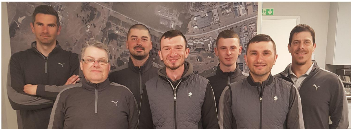
2021 FEGGA Greenkeeping Scholarship Students

The lecture programme will be endorsed by both FEGGA and Kristianstad's Golf Club and each student will receive a Certificate of Excellence on completion of the programme that concludes on the 12 th October 2022.